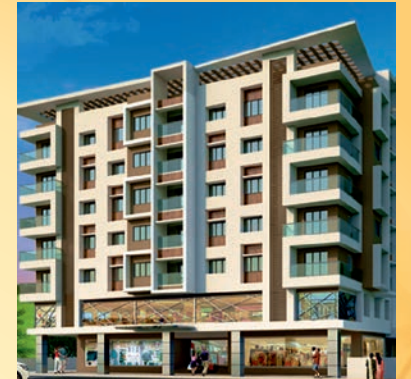
Kudva's Grandeur Surathkal, Mangalore