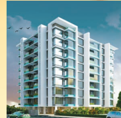
Eve Anna Homes Kottara Chowki, Mangalore