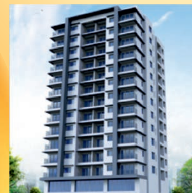
Ocean-Wind Pandeshwara, Mangalore