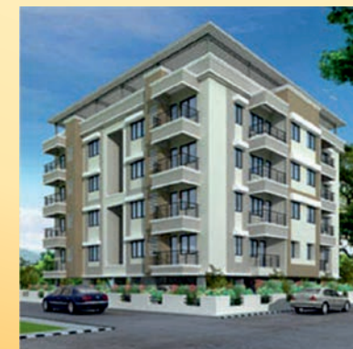
Maurya Residency Matadakani Road, Mangalore