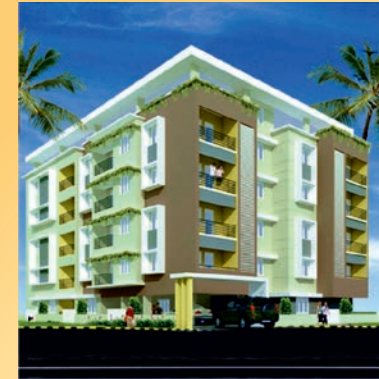
Bhargavi Gloria Residency Kuntikana, Mangalore