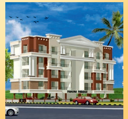
Yamuna Paradise Kottara Chowki, Mangalore